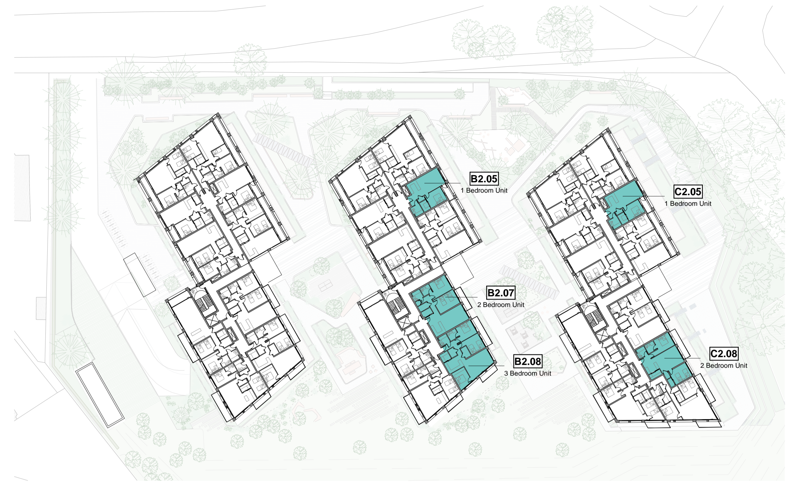
2 Part V Proposal - Level 2 scale 1 : 500